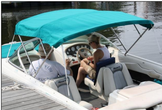
The Sea Ray Start/Stop Test