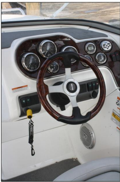
The Sea Doo