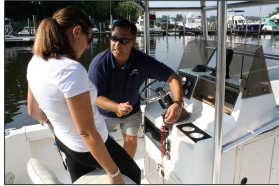
The Mako Start/Stop Test