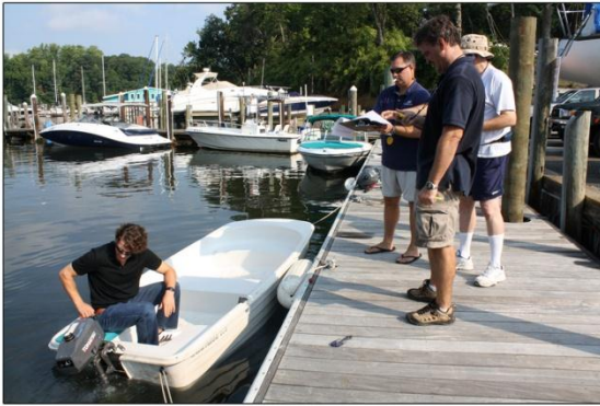
The Dinghy Start/Stop Test