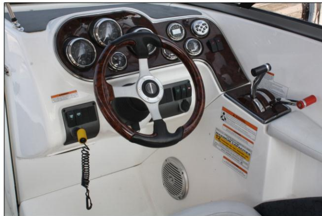
The Sea Doo