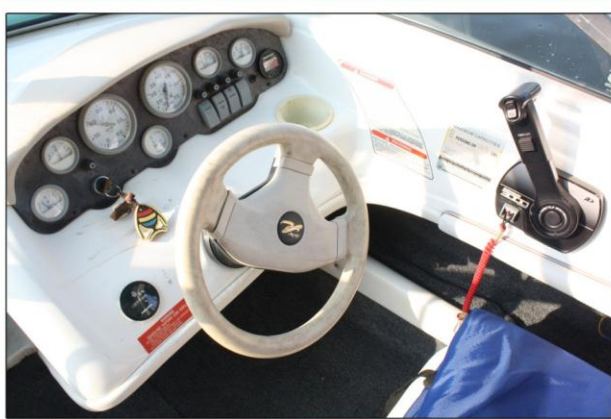
The Sea Ray