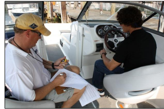
The Sea Doo Start/Stop Test